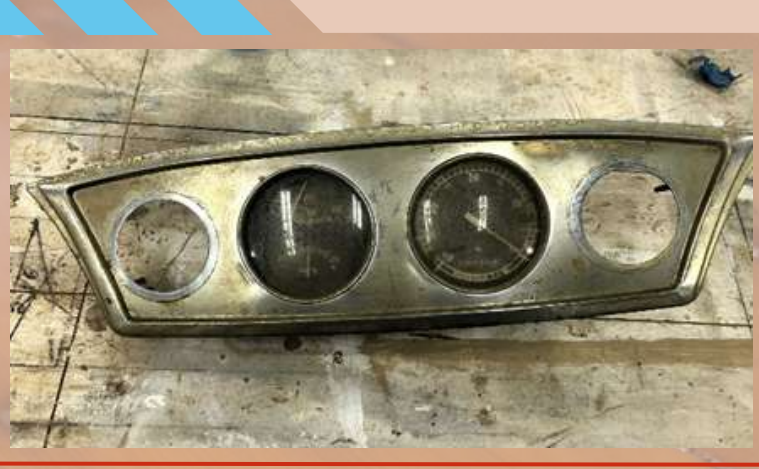
Guages before and after