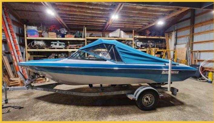
(The Kids' '94 Blue Water "Ka - Bluey" put to bed for the season)

As we embrace the rhythms of the cooler days and tuck our boats away for the winter, neatly drained, dried, and winterized, it becomes time to prepare anew for the next busy boating season. Some of us have exciting new projects, while others enjoy a rest from the comings and goings of a busy travel season.