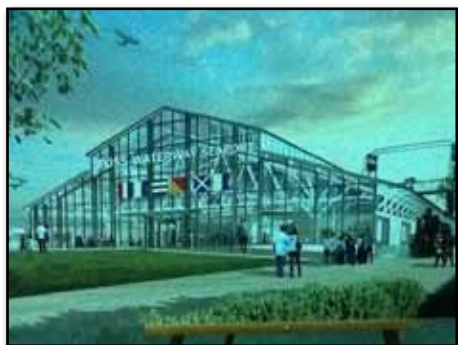
This is a concept drawing of the Museum Project.