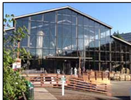
ACBS May meeting was held at the Museum with a catered dinner provided by The Spaghetti Factory

705 DOCK STREET, TACOMA, WA 98402 - 253-272-2750